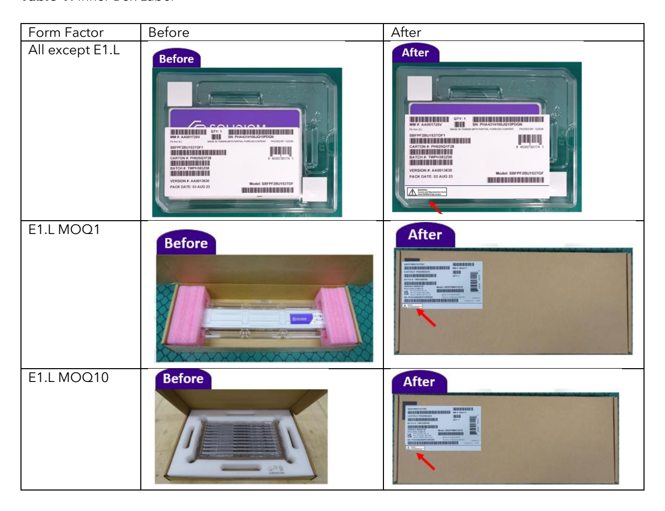
Table 2: Outer Box Label